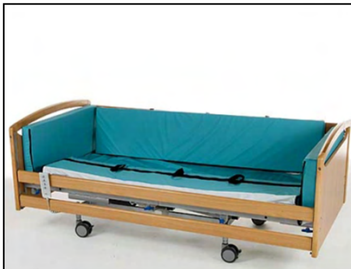
5. Position the side bumper against the far siderails & attach loosely using the velcro straps.