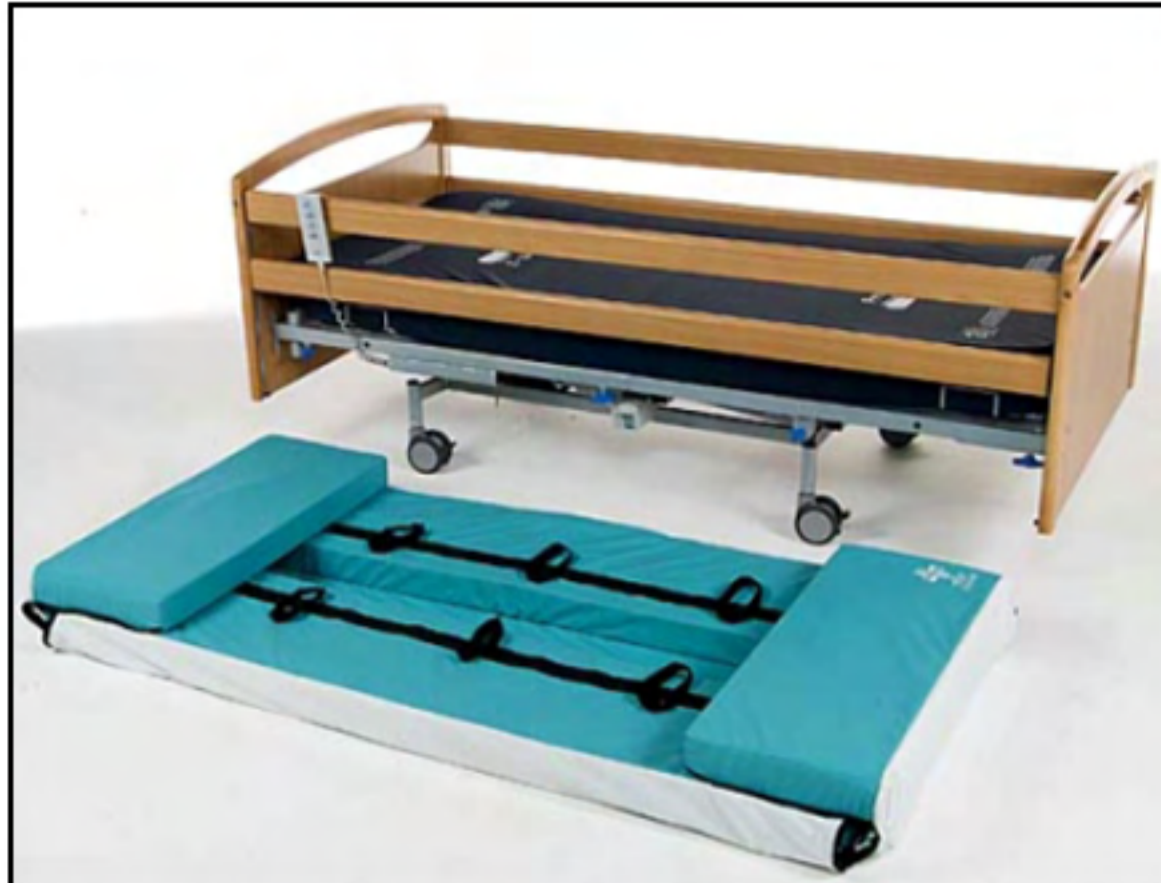
1. Remove Cocoon from packaging & place on the floor in front of the bed