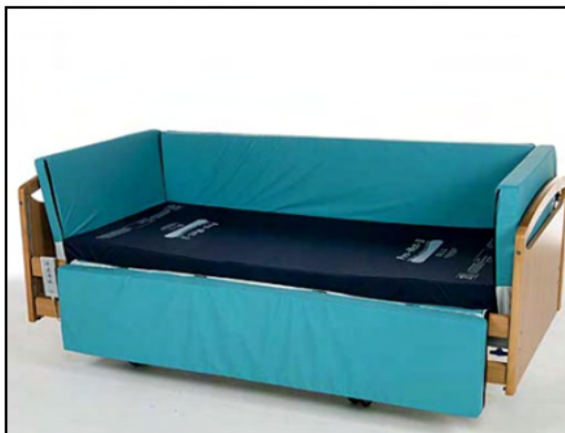
8. ** Position the mattress within the 'envelope' - easing it under the bumpers.

**TIP It is much easier to fit sheets to the mattress before attempting Step 8.