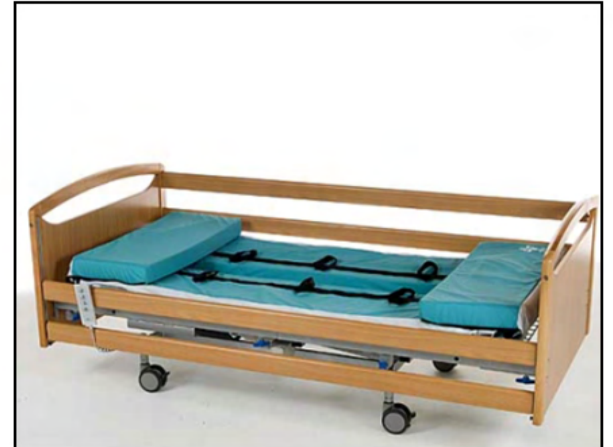
3. Position the Cocoon on the bed as shown.