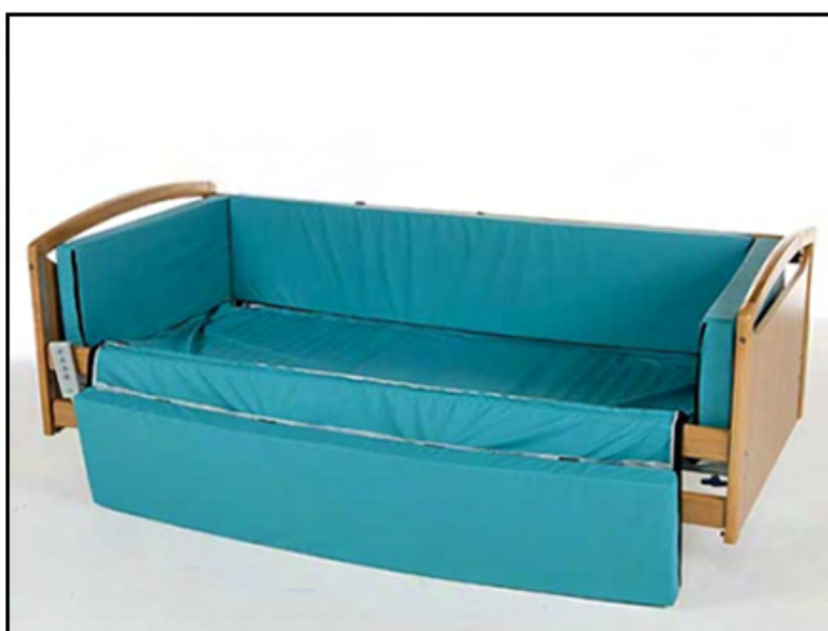
7. Lower the side bumper closest to you to reveal the mattress 'envelope'.