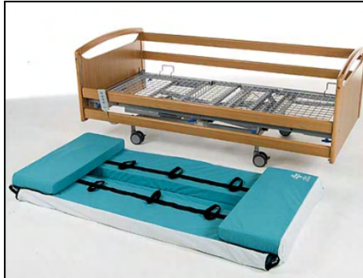
2. Lower the siderails nearest to you and remove the mattress.