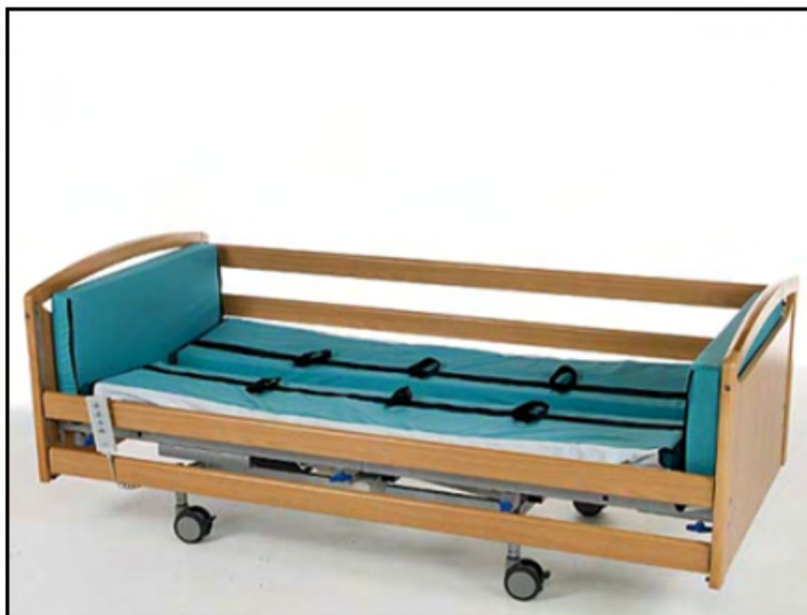
4. Position the end bumpers against the head/footboards as shown.