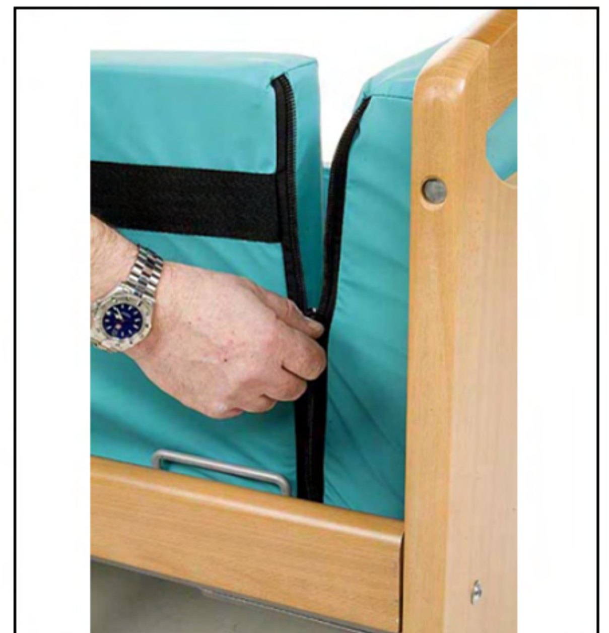
6. Zip together the side and end bumpers at the far side.